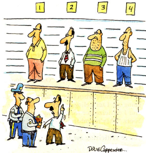
"It's number two! That's the man who stole my identity."