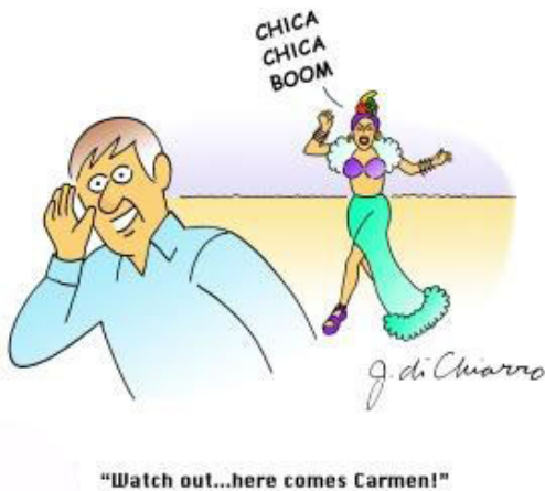
THE ORIGINAL MIRANDA WARNING

A man was caught for speeding and went before the judge. The judge asked the man, "What do you want?... 30 days or $30." The man replied, "I think I'll take the money your honor."