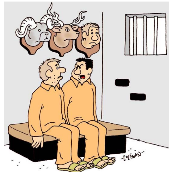
" YOU GOT TWENTY YEARS FOR HUNTING WITHOUT A LICENSE? KIND OF STIFF, ISN'T IT ? "