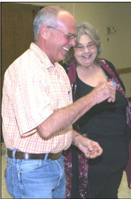
Perry was lucky enough to pull his own number for the 50/50 drawing. Surrre!