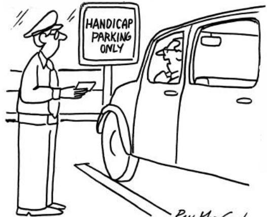
"Well, I consider myself handicapped until I have my first cup of morning coffee..."