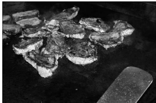
Wow, What a treat!

In 1934 engineer Paul Galvin and his associate, William Lear, invented the automobile dashboard radio they called the Motorola, meaning "sound in motion," from which the two-way radio system used in police cars was developed.