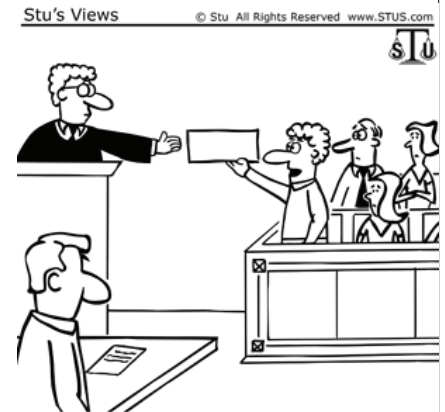
We find the Defendant guilty, the lawyers tedious, and you arrogant.