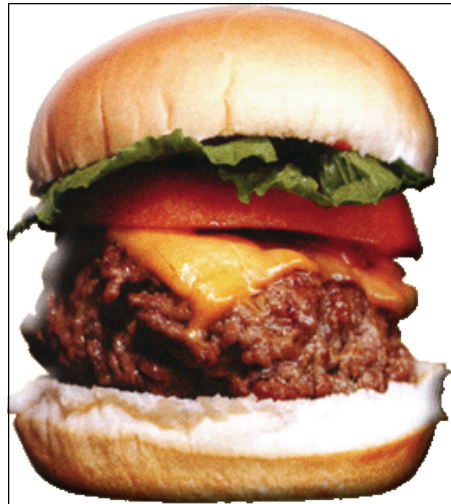
Yum! Can't wait for the Footprinter's BBQ at Dianes.