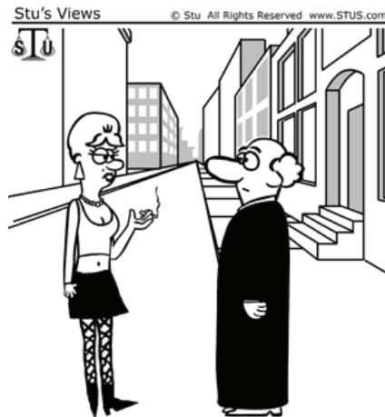
Your Honor, may I please the Court?