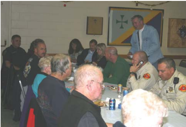
Great turnout for Christmas Dinner