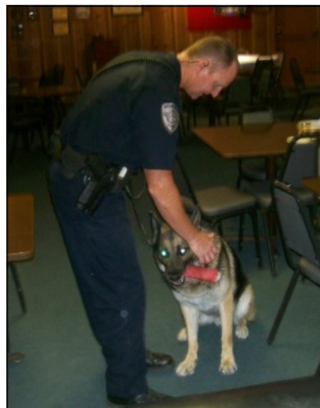
"Good boy Nitto, a job well done"