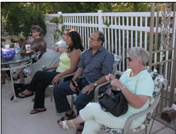
Here's the whole gang sitting around the pool.