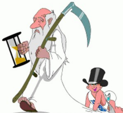
Goodbye, 2008 ... Hello, 2009