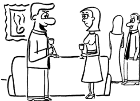
My New Year's resolution is to win at least one of my frivolous lawsuits.