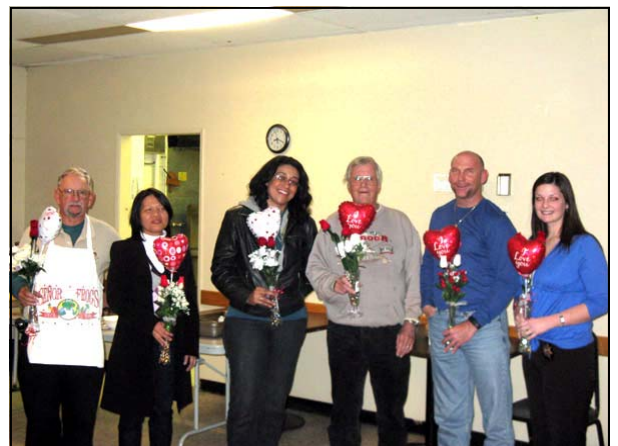
Happy Valentine's Day from us to you.

"No, but it will get the silly smile off your face."